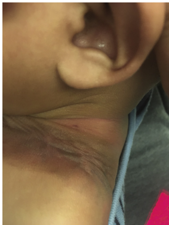
Fig 1. Atrophic plaque on the left supraclavicular area of a 5-month-old boy.