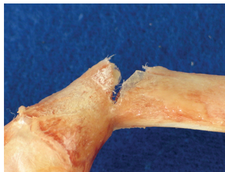
FIGURE 2: Metacarpal fracture line passes from the dorsal cortex to the volar cortex short oblique or transverse (AO A2 fracture type).

reached higher values compared to the native bones (stiffness mean 49.9% SD 25.1%, P = 0.893 ; yield load mean 82.8% SD 20.6%, P = 0.063 ) than the monocortical-fixed bones (stiffness mean 40.9%, SD 14.5%, P = 0.910 , yield load mean 58.8%, SD 18.9%, P = 0.114 ) (Figure 3, Table 1).