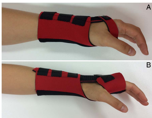
Figure 2 (A) Night splint—wrist included in neutral position (used if participant has a negative Berger's test). (B) Night splint—wrist and Metacarpal phalangeal joints included in neutral position (used if participant has a positive Berger's test).

Participants will be asked to rate the change in their symptoms since starting the study on the global rating of change scale. 35 This scale measures perceived improvement on a 15-point Likert scale ranging from a very great deal worse