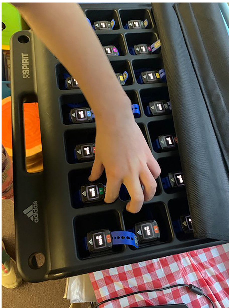
Figure 3. Watch storage.

expertise of the teacher and support of the administration. Pedal desks were placed in classrooms in two different applications across two grades. The initial implementation was as a learning station of six pedal desks grouped together in one specific classroom for math and reading. This class housed 21 students. This station was separate from the traditional seating which students were in the majority of the time. The second implementation was as a full classroom seating environment for a class of 23 students. The first picture shown demonstrates the setting in the first-grade classroom compared to the second-grade classroom set up. The second-grade classroom not only had individual pedal desks for each student, but also heart rate monitors (second picture).