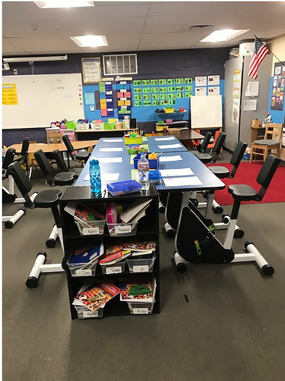
Figure 1. First grade classroom organization/set-up.

Benes et al. (2016) found that teachers are knowledgeable about the health and cognitive benefits of adding movement to the classroom, yet teachers are hesitant to do so. Some reasons listed include; lack of implementation knowledge, lack of support from within the school, lack of ability to explain the research supported neurological connections, and nervousness concerning student “buy-in”. Many teachers also reported a