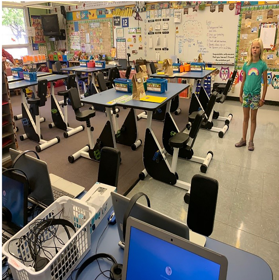
Figure 2. Second grade classroom organization/set-up.