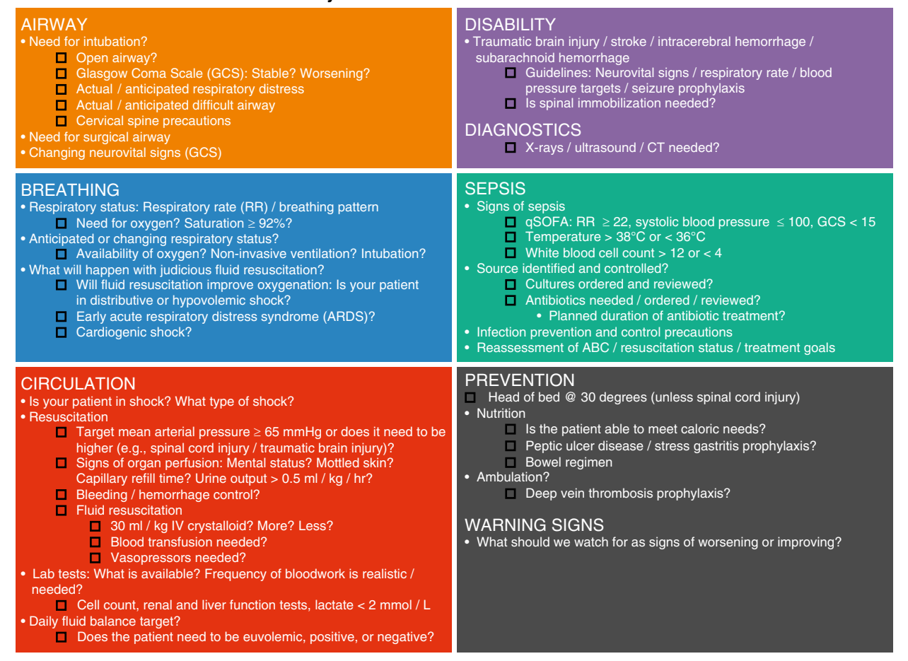
Figure 2. Modified airway, breathing, circulation, disability (ABCD) assessment. CT = computed tomography; qSOFA = quick sepsis-related organ failure assessment.

after their introduction showed the majority of doctors felt more supported in their clinical decision making (15/16), and a quarter of doctors said their initial plan was changed as a result (4/16).