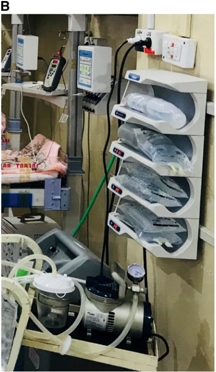
Figure 1. (A) Modified T-piece apparatus made with a 10-ml syringe. The shaft of the 10-ml syringe is cut and the endotracheal tube is inserted into the shaft. Oxygen tubing is applied to the needle end of the syringe. The plunger of the syringe is removed. The finger of a glove is cut (top and bottom) and placed on the plunger end of the syringe to create a one-way valve. (B) Monitors (top left), electricity (top right), fluid warmer (right), and suction equipment and oxygen concentrator (bottom) denote basic equipment for critical care.

population movements, outbreaks, natural disasters, and social or cultural challenges (Table 1). In a global society that values access to health care, such access should not exclude the knowledge and skill that critical care can bring to humanitarian efforts. Humanitarian settings differ from established environments in that doctors and teams are often not trained in critical care; the ability to monitor patients can be very limited; there can be overwhelming patient volumes, limited human resources, and limited critical care equipment; and