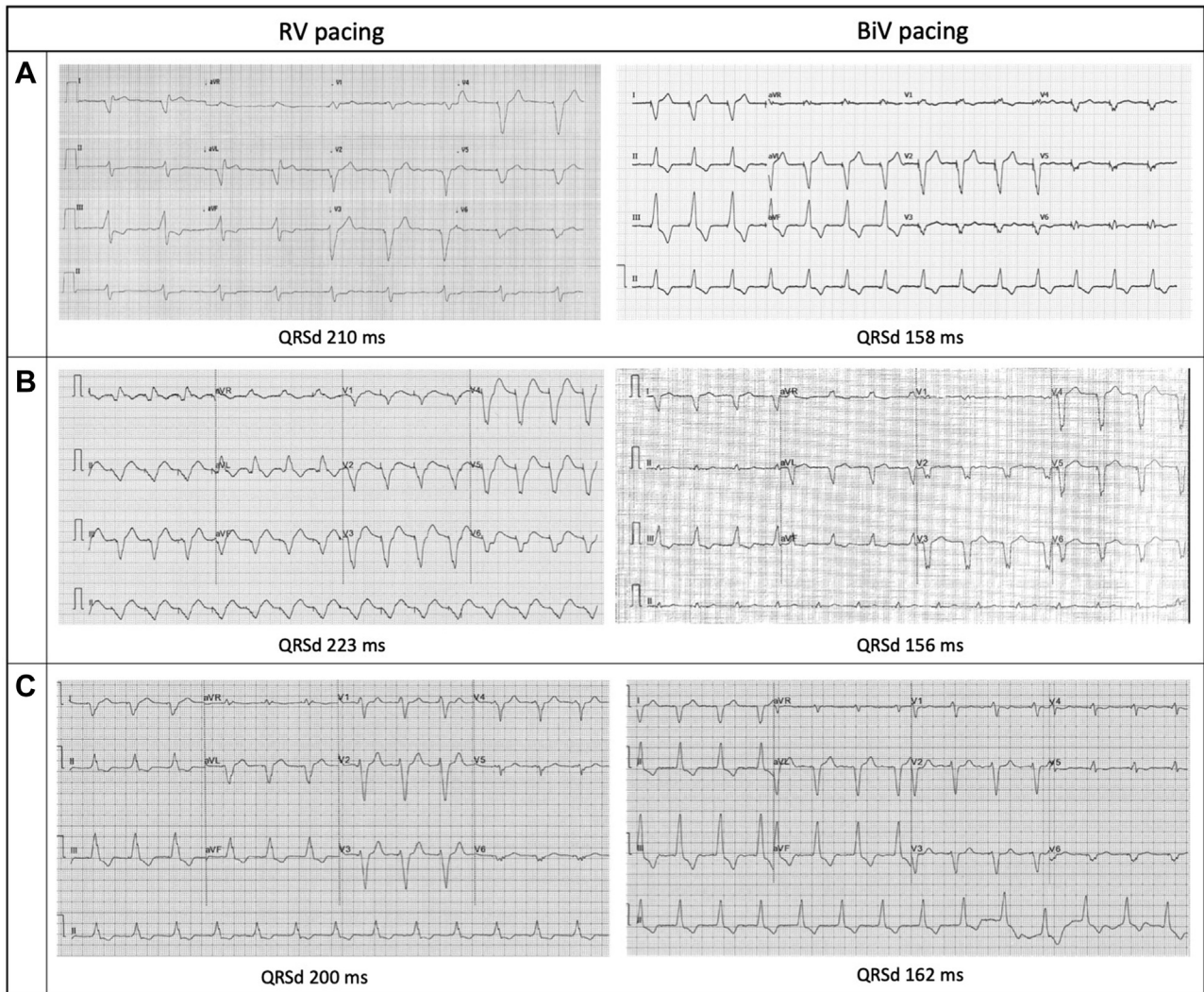
Figure 2 Surface electrocardiograms. A: Right ventricular (RV) pacing from initial Micra leadless pacemaker (left) and biventricular (BiV) pacing from the initial Micra and WiSE-CRT system (right). B: RV pacing from the second Micra leadless pacemaker (left) and BiV pacing from the second Micra and WiSE-CRT system (right). C: RV pacing from the third Micra leadless pacemaker (left) and BiV pacing from the third Micra and WiSE-CRT system (right). QRSd = QRS duration.

paced R wave was small in amplitude with intermittent undersensing (Figure 3D). There was reliable tracking by the WiSE-CRT system, with effective electrical resynchronization seen on electrocardiogram (ECG) (Figure 2B). Prior to discharge, the patient experienced an inappropriate shock. Recordings from the S-ICD demonstrated oversensing of myopotentials prior to delivery of the shock (Figure 3E). On further testing, the noise was replicated by movement of the left arm. S-ICD lead position was acceptable on chest radiography (Figure 1B). The S-ICD was reprogrammed to the primary sensing vector, as this minimized the noise; however, this resulted in intermittent T-wave oversensing. During a period of observation there were further episodes of myopotential oversensing detected; however, owing to their intermittent nature, no further shocks were delivered by the device.