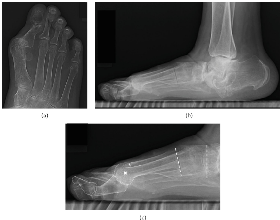
FIGURE 2: Preoperative weight-bearing radiographs of the foot. (a) Anteroposterior view of the foot showing hallux valgus deformity and no clear space at the metatarsophalangeal joint. (b, c) Lateral view of the foot showing the destruction of the Chopart and subtalar joints, as well as misalignment of the hallux including elevation of the first metatarsal, plantar deviation of the proximal phalanx, and interphalangeal hyperextension. The two-way arrow indicates the distance between two dorsal cortices of the first and second metatarsals, indicating an elevated first metatarsal. The cross indicates the approximate center of the metatarsal head. Dotted lines show the naviculocuneiform and tarsometatarsal joints.

sites was confirmed. At the latest follow-up at 44 months postoperatively, the patient had no complaints of pain and was satisfied with the result. No progression of hind-foot destruction and flatfoot deformity has occurred (Figure 3). IP joint dorsiflexion angle, the angle between the longitudinal axis of the first distal phalanx and that of the first proximal phalanx, was slightly improved from 43 degrees preoperatively to 36 degrees at the latest follow-up. The operated foot showed the disappearance of the callosity on the plantar hallux IP joint and ground contact at the first metatarsal head in the standing position (Figure 4). The range of motion was up to 40° in dorsiflexion and 30° in plantar flexion at the MTP joint.