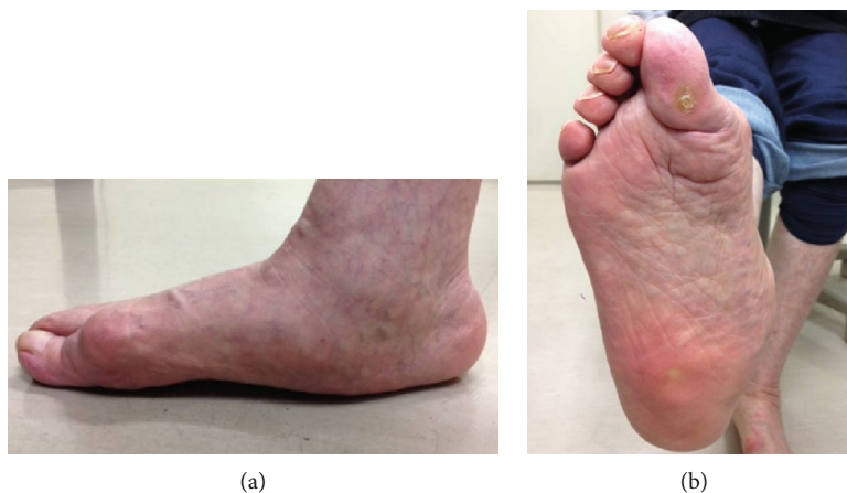
FIGURE 1: Preoperative photographs of the affected foot. (a) Lateral view of the weight-bearing foot showing rocker bottom deformity, elevated first metatarsal, interphalangeal hyperextension of the hallux, and ground contact at the interphalangeal joint of the hallux. (b) Sole of the foot showing callosity on the plantar surface of the interphalangeal joint of the hallux.

for surgical treatment. Her right foot showed severe hindfoot valgus, rocker bottom deformity, and hyperextension of the hallux IP joint in the standing position (Figure 1). The medial forefoot had ground contact not at the first metatarsal head but at the hallux IP joint, which corresponded to the location of the painful callosity. The range of motion at the metatarsophalangeal (MTP) joint was limited to 0^\circ in dorsiflexion and 40^\circ in plantar flexion. She was unable to flex the hallux IP joint actively, suggesting the ruptured or elongated flexor hallucis longus tendon.