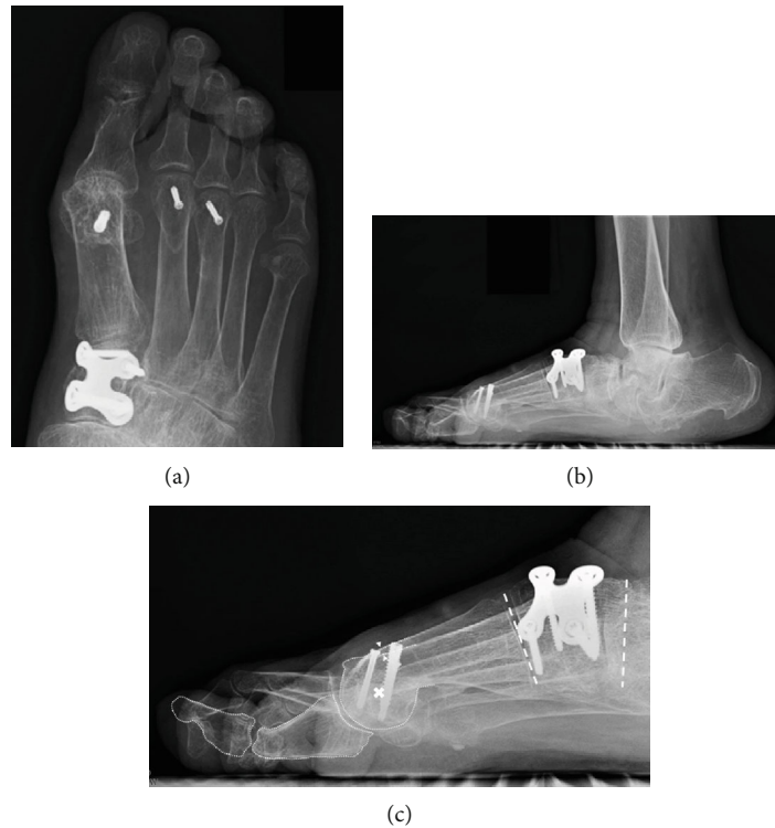
FIGURE 3: Postoperative weight-bearing radiographs of the foot. (a) Anteroposterior view of the foot showing improved hallux valgus deformity and congruent metatarsophalangeal joint. (b, c) Lateral view of the foot showing improvement of the elevated first metatarsal, plantar deviation of the proximal phalanx, and interphalangeal hyperextension. The two arrowheads indicate the distance between two dorsal cortices of the first and second metatarsals, indicating improvement of the elevated first metatarsal compared with Figure 2(c). The cross indicates the approximate center of the metatarsal head. Dotted lines drawn along the naviculocuneiform and tarsometatarsal joints demonstrate the improvement of plantar flexion by approximately 10^\circ after the Cotton osteotomy.