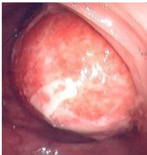
Figure 1 Intraluminal mass visualized at colonoscopy.

the proximal transverse colon, measuring respectively 9 and 6 cm, showing extensive vascularization following contrast injection; a solid homogeneous mass involving the distal transverse colon and left colic angle walls; multiple hypodense lesions with defined borders located in the hepatic hilum, Morrison's space, omentum and para-aortic region. A colonoscopy was performed, showing an intraluminal, yellowish lesion with clear margins in the transverse colon which didn't allow a further progression of the endoscope (Fig. 1). Biopsies showed unspecific inflammation: decreased density and dismorphism of glands, inflammatory infiltrate in corion, necrotic material and granulation tissue.