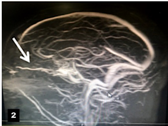
Fig. 2. MR venogram showing enlarged left ophthalmic vein indicating the obstruction of the cavernous sinus.

the enlargement of the ophthalmic vein had disappeared in a subsequent MR venogram (Fig. 3).