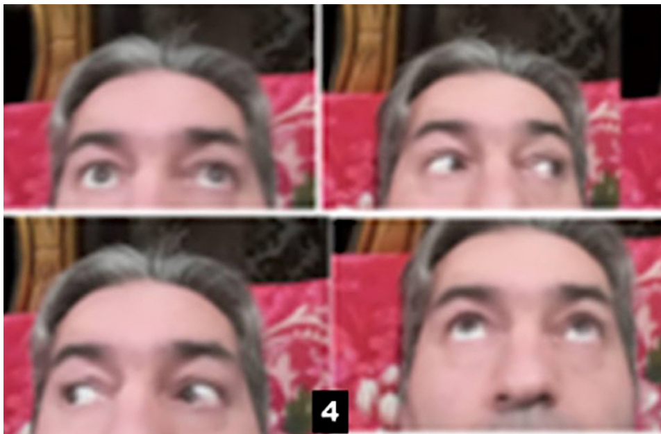
Fig. 4. Digital photograph 4 months after the onset, (a–d) demonstrates the recovery of proptosis and ptosis. Note that eye movements in all directions are normalized.

Magnetic resonance imaging (MRI) is not always conclusive in septic CST [7,22,23]. However, an enlarged and dilated superior ophthalmic vein, in magnetic resonance venogram (MRV) is an important feature of CST which is indicative of the obstruction of the cavernous sinus [22,23].