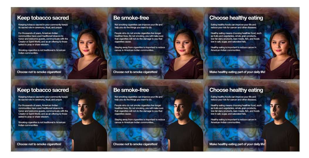
Fig. 1. Messages used in the cultural benefits of not smoking cigarettes condition (left), the health benefits of not smoking cigarettes condition (center), and the healthy eating comparison condition (right), for girls (top row) and boys (bottom row).