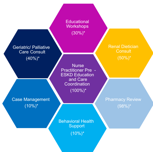
Figure 2. Montefiore's Kidney Care Program offerings and proportion of patients who receive each offering. Proportion of patients in interdisciplinary care who receive each offering (*). Abbreviations: ESKD, end-stage kidney disease.

open to all Montefiore patients and their families. The NP meets monthly with the CMO team, including the program's medical director, to review the new patients enrolled, complex cases, and those patients who are transitioning to ESKD. Care coordination decisions are then communicated to the patient by the NP.