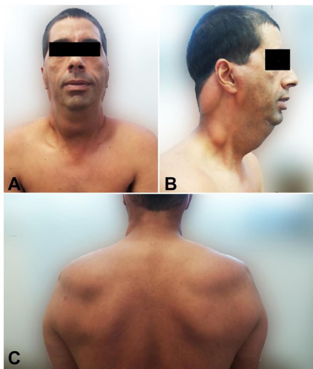
Figure 1. Pre-operative examination. Note the tumors in A and B – the anterior cervical submandibular regions, and pre- and post-auricular regions; and C – in the back.