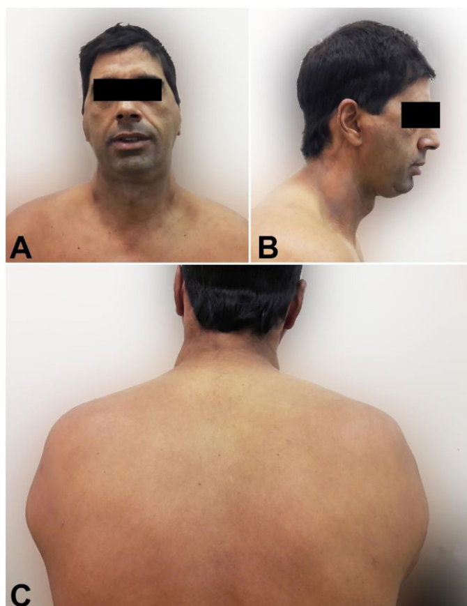
Figure 3. Early post-operative examination showing a favorable esthetic result in both the cervical region ( A and B ) and the back ( C ).

MSL—which is called Madelung disease, Launois–Bensaude disease, or benign symmetrical lipomatosis—was first described by Benjamin Brodie in 1846, followed by reports by Madelung, and Launois and Bensaude, in 1898. MSL is a rare disease of fat metabolism. The subcutaneous unencapsulated fatty tissue overgrowth is painless and symmetrically involves mainly the head, neck, and upper torso, and eventually the upper extremities. 1 MSL typically presents between the third and the fifth decade of life and is more prevalent in males, 1,2 with the male to