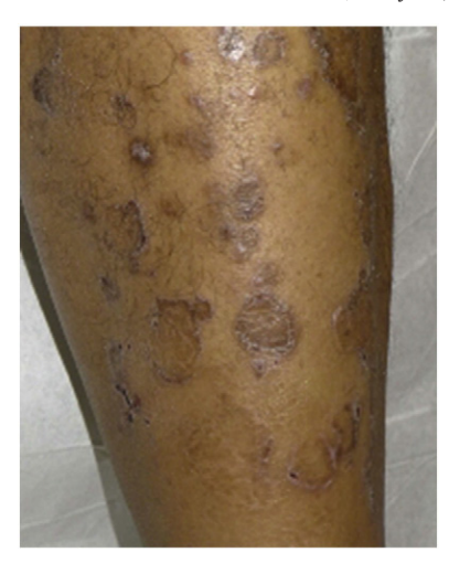
Fig. 8. Annular lichen planus.

Untreated nail LP may progress to anonychia (Fig. 5), so diagnosis and prompt treatment is important. Conservative first-line therapies include superpotent TCS, often under occlusion, but these are usually unsuccessful. Intralesional steroids are more effective; a single injection of triamcinolone acetonide 10 mg/ml into the proximal nail fold yielded complete recovery within several months and lasted 2 years in one patient (Brauns et al., 2011). Alternatively, systemic steroid therapy with oral prednisone or intramuscular injection of triamcinolone acetonide has provided better outcomes. Unfortunately, recurrence has been reported with all therapies for nail LP (Brauns et al., 2011).