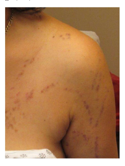
Fig. 6. Linear lichen planus.

treated until they become inflamed, ulcerated, or sore (Le Cleach and Chosidow, 2012; Wagner et al., 2013). While reticular lesions may resolve spontaneously, other forms of OLP are much less likely to do so. First line treatment includes TCS prescribed according to lesion severity (Ismail et al., 2007). Topical immunomodulators can be applied directly or as a rinse. Further, topical retinoids have been used as an alternative choice in treating oral LP. Erosive lesions can be treated with TCS under occlusion. Resistant lesions may require systemic steroid therapy or other systemic immunosuppressants for resolution (Farhi and Dupin, 2010; Ismail et al., 2007).