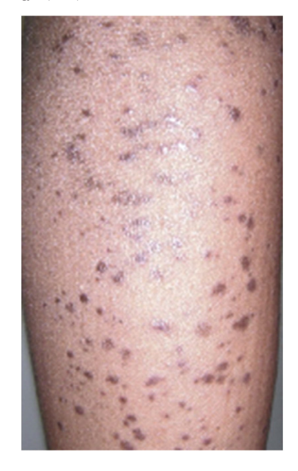
Fig. 2. Lichen planus.

therapies include topical and systemic retinoids; systemic steroids; and topical tacrolimus, metronidazole, griseofulvin, and cyclosporine. Third-line therapies, including psoralen plus UVA (PUVA), thalidomide, mycophenolate mofetil, low molecular weight heparin, and iontophoresis, have also been reported as effective (Rashid et al., 2008). Systemic treatments are usually reserved for severe recalcitrant cases and are typically used in combination with TCS or phototherapy. Post-inflammatory hyperpigmentation is often seen after treatment and may take years to fade.