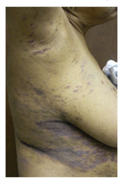
Fig. 12. Lichen planus pigmentosus inversus.

et al., 2008). An increased reporting of lesions that are both atrophic and annular has occurred in the literature, spurring the definition of a new variant, atrophic annular lichen planus. Atrophic lesions are often asymptomatic, although a portion of patients may experience pruritus. Genital lesions, especially of the penis and scrotum, are common and may be the underlying cause of a perceived male predominance (Badri et al., 2011). Lesions also favor the intertriginous zones, including the axillae and groin folds, but can also occur on the lips, trunk, or arms (Holmukhe et al., 2012; Reich et al., 2004). Annular lesions are typically localized, but generalized eruptions have been documented (Lee et al., 2011). Histopathological examination reveals classic features of LP in the active edge of the lesion. Tissue from the center of annular lesions shows a sparser lymphocytic infiltrate and fewer Langerhans cells compared to tissue from the advancing border regions (Yamanaka et al., 2004).