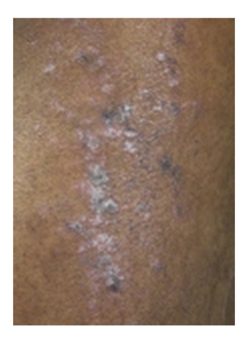
Fig. 1. Lichen planus.

In general, management of classic cutaneous LP depends on the location and severity of lesions and is largely based on clinical experience. Most cutaneous LP lesions resolve spontaneously within a few years. Goals of treatment include shortening the time from onset to resolution and reducing symptoms, especially pruritus. Topical corticosteroids (TCS), usually class I or II TCS, are the first line of therapies and typically suffice to alleviate symptoms. In cases where TCS fail to control pruritus, narrow-band UVB (NBUVB) often works well. Other second-line