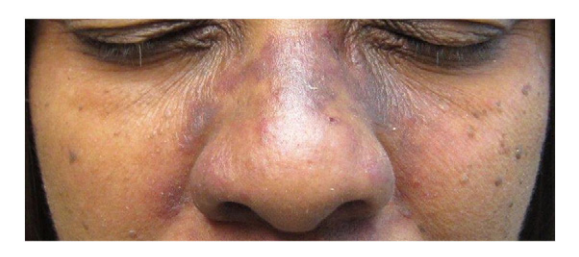
Fig. 15. Lichen planus/ lupus erythematosus overlap.

Hypertrophic LP lesions typically present as red, yellow-gray, or redbrown papules and plaques, most often on the pretibial area of the lower extremity and the ankles. Lesions can also appear on other areas of the lower limb, the upper limb, trunk, or in a generalized fashion. They are firm to palpation and display a vertucous or hyperkeratotic