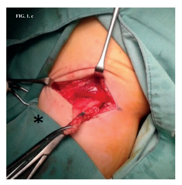
FIG. 1. a-c. Ultrasound assay: Preperitoneal fat and bowel herniating through the transversalis fascia (white arrow). Iliac crest (black arrow) (a). Preoperative presentation of the Spigelian hernia (large arrow). Left inguinal hernia operative scar (small arrow) (b). Preperitoneal fat and peritoneum herniating through the transversalis fascia. Left inguinal incision site (asterisk) (c).

pathogenetic origin of both pathologies (1,2,5); embryonic testis descent in between the layers of the anterior wall results in testicular ectopia and a secondary Spigelian hernia (5).