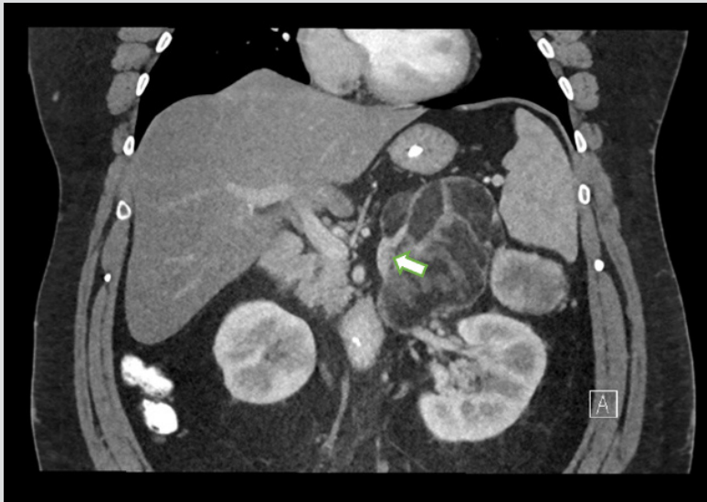
Figure 1. Coronal contrast-enhanced CT images shows an engorged left adrenal vein emanating from the mass, in keeping with an adrenal neoplasm

A CT of the abdomen/pelvis with/without contrast obtained during hospitalization revealed a left 23 cm mass containing both soft tissue and macroscopic fat elements consistent with adrenal myelolipoma (Figs. 1–3). A right adrenal nodule measuring 2.5 cm was also seen that was in keeping with an adrenal myelolipoma. Further discussion with the patient revealed he had a known diagnosis of CAH at birth. He was previously treated with fludrocortisone/hydrocortisone as well as leuporelin/somatotropin but stopped treatment sometime in his mid-teens for unclear reasons. Blood tests revealed 17-hydroxyprogesterone of 17,300 ng/dl, AM cortisol of 1.17 µg/dl, DHEA-S of 48.2 µg/dl, total testosterone of 406 ng/dl, and ACTH of 128 pg/ml.