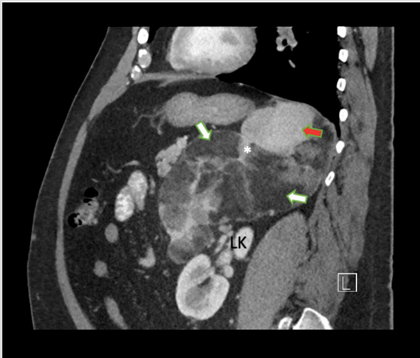
Figure 3. Large mixed attenuation mass occupying the left suprarenal fossa. Sagittal contrast-enhanced CT image shows a 23 cm mass containing fat (white arrow). Several enhancing septations are also noted (*). The mass is separate from the left kidney

The option of adrenalectomy was discussed with the patient once he was medically ready. It was also recommended that he resume replacement hydrocortisone and fludrocortisone as he was at risk for adrenal crisis if he decompensated. However, the patient was concerned that this would lower his endogenous testosterone levels and was not interested in the prospect of testosterone replacement. He opted to cancel his future follow-up with endocrinology despite being made aware of the risks.