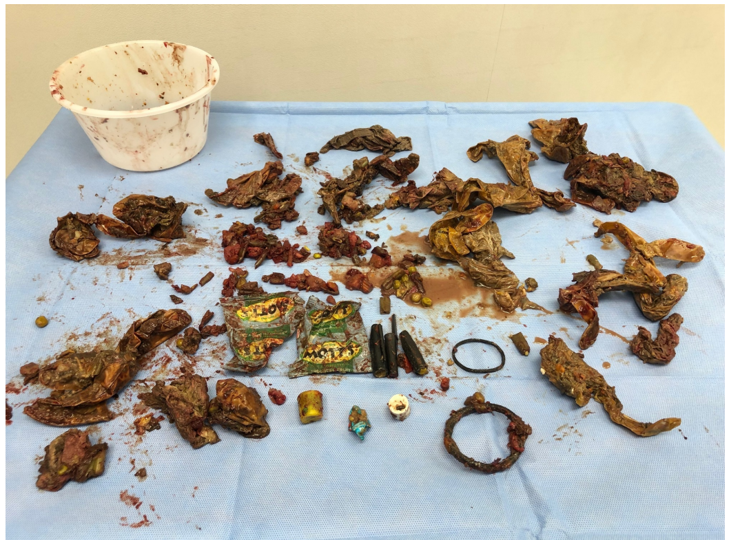
FIGURE 2: Stomach content.