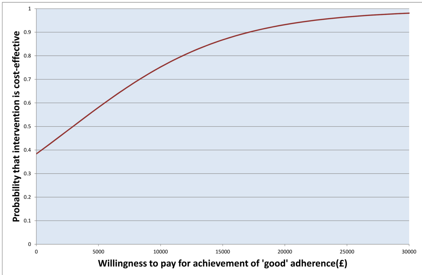
Fig 2. Cost-effectiveness acceptability curve: proportion achieving good adherence over the intervention period.