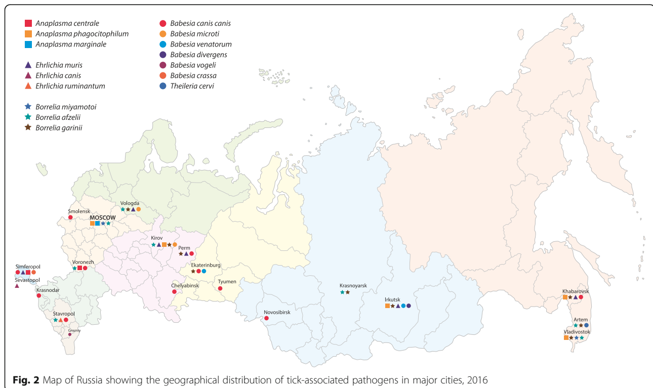
Fig. 2 Map of Russia showing the geographical distribution of tick-associated pathogens in major cities, 2016