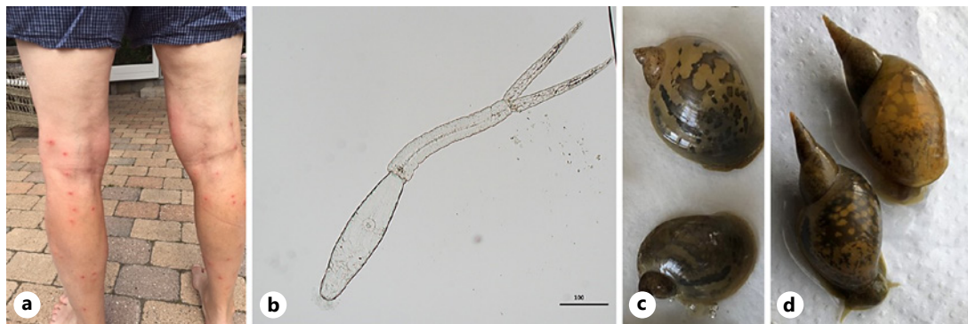
Fig. 1. Skin changes due to swimmer's itch case from Esrum Sø. Photograph provided by the patient (a), Trichobilharzia cercariae released from the freshwater snail Lymnaea stagnalis sampled in lake Ringen Sø (b), Radix balthica sampled from lake Furesø (c), Lymnaea stagnalis collected from lake Ringen Sø, and (d), both were freshwater snails.

water snails and waterfowl as intermediate and final hosts, respectively [2]. Cercariae may penetrate human skin but are not able to complete the life cycle within the human accidental host, and are believed to die soon after penetration. This results in a local inflammation, which typically starts with a tingling or burning sensation and then develops into an itchy maculopapular eruption [1, 3]. The time from exposure to onset of symptoms varies from a few minutes to a maximum of 24 h after exposure. Typically, and approximately 1 h after exposure, the cutaneous lesions begin as a pruritic macular erythematous eruption that progresses to a papular, papulovesicular, and urticarial eruption. The red inflammatory lesions typically cover skin surfaces that have been exposed to water. It peaks within 1–3 days and lasts 1–3 weeks. In cases of repeated exposures, the reaction is often more rapid and severe, indicating sensitization and allergic reactions [4, 5]. During recent years, we have observed an increasing occurrence of cercarial dermatitis in Denmark, when recreational bathing activities coincide with release of cercariae from intermediate hosts snails [6, 7]. During the summer 2019 to the end of summer 2020, we studied 5 cases of swimmer's itch. In 2 of the cases, patients exposed to the same lake water at the same time developed different clinical symptoms, and we suggest that previous parasite exposure may exacerbate the symptoms.