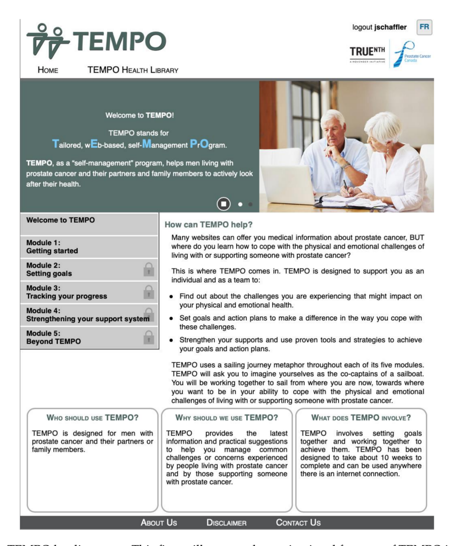
Figure 2. TEMPO landing page. This figure illustrates the navigational features of TEMPO including the introduction, the five modules dyads completed, and the health library [40].