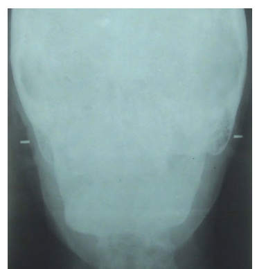
\textbf{Figure 8.} \ \mathsf{Case} \ 2 \ \mathsf{antero-posterior} \ \mathsf{radiography}.