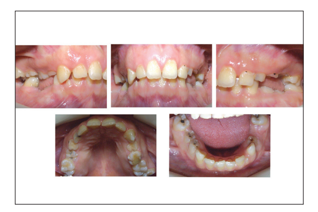
Figure 5. Case 2 intraoral photographs.