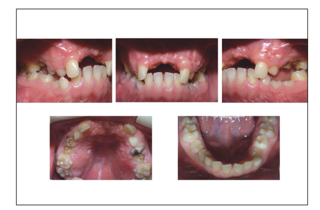
Figure 1. Case 1 intraoral photographs.