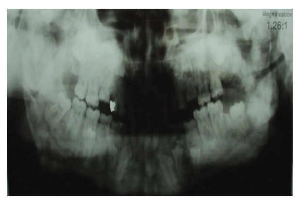
Figure 3. Case 1 panoramic radiography.