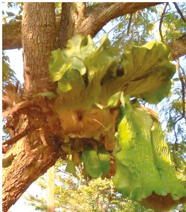
FIGURE 1: Platynerium stemaria (Beauv) Desv. epiphyte of a tree of Terminalia mantaly , Yaoundé, Cameroon (July 2, 2020).

2.2. Extracts Preparation Using Serial Exhaustive Extraction Method. The fresh plant materials were washed separately with fresh water to remove dirt and other contaminants, shade-dried for three weeks still constant weight, and ground to fine powders. For extraction, 100 g of powder was transferred in different Erlenmeyer flasks and macerated under shaking for 72 hours in hexane, ethyl acetate, ethanol, methanol, hydroethanol (30/70), and distilled water. Infusion and decoction were also prepared. The residues obtained after each of the extraction were submitted to gradual extraction using solvents of increased polarity. The residue from hexane extraction was extracted successively with ethyl acetate, methanol, and water, the residue from the ethyl acetate