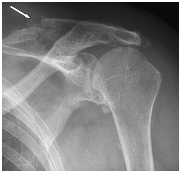
Fig. 1 (Patient 1) X-ray of left shoulder showing scapular spine fracture, two months after initial symptoms ( white arrow )