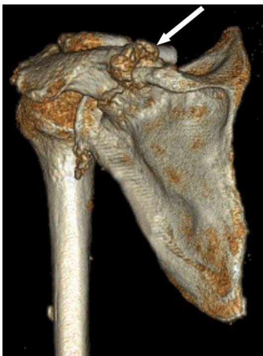
Fig. 2 (Patient 1) CT reconstruction of left shoulder showing scapular spine fracture ( white arrow )

consolidation of the fracture. After discussing operative and conservative options, she chose conservative treatment. At her last follow-up, she had developed a stiff shoulder. The shoulder pain is sufficiently treated with analgesics.