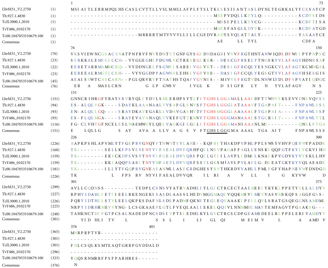
FIGURE 2: Multiple sequence alignment of trypanosome PLA 1 . Alignment of the protein sequences of cloned T. brucei , T. cruzi , and L. braziliensis PLA 1 and T. congolense and T. vivax putatives PLA 1 was performed with NTI 10 Software (Invitrogen) using the Clustal W algorithm. The lipase consensus pattern is underlined. Letters indicate: identical (red), conserved (blue), similar (green), weakly similar (grey), and nonsimilar (black) amino acids. Leishmania braziliensis PLA 1 (TriTrypDB LbrM31_V2.2750), Trypanosoma brucei PLA 1 (TriTrypDB Tb.927.1.4830), Trypanosoma congolense putative PLA 1 (TriTrypDB TcIL3000.1.2010), Trypanosoma vivax putative PLA 1 (TriTrypDB TvY486_0102170), and Trypanosoma cruzi PLA 1 (TriTrypDB Tc00.1047053510679.100).

was observed and therefore, nonhaemolytic activity was detected [28]. Further, it was determined in four different species of African trypanosomes that Ca 2+ -independent PLA 1 was the predominant PC-degrading activity. The levels of PLA 1 varied widely, with very high activity in the pathogenic T. brucei and relatively low activity in the nonpathogenic T. lewisi species [29]. Other authors found that T. brucei bloodstream forms possess high levels of PLA 1 activity, whereas in the procyclic culture forms PLA 1 specific activity was only 15% of that of bloodstream forms, suggesting an important physiological role for the enzyme in the mammalian stage [30]. Bloodstream trypomastigotes are covered with a dense layer of Variant Surface Glycoprotein (VSG), which protects the parasite from lysis by host complement via the alternative pathway [31]. It has been