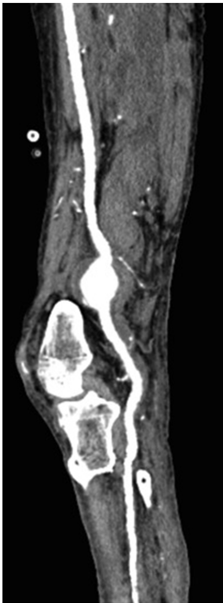
Figure 1. Computed tomography angiogram demonstrating the right 4 × 5 cm right saccular popliteal artery aneurysm (lateral view).

45 mm) with a haematoma in the medial aspect of the leg just above his knee that measured 11.4 × 5.2 cm. The patient was discharged home the same day and referred to the authors' vascular service for an urgent outpatient appointment that took place 7 days later. At this point, the patient was found to be having difficulty walking owing to pain in his right leg and he was admitted from the clinic as an emergency.