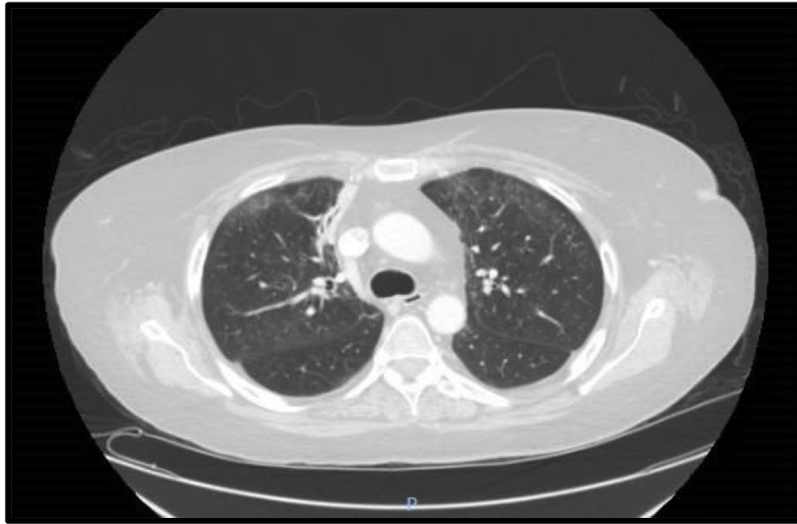
Fig. 1. CT chest on admission showing scatter bilateral groundglass opacities.

glass opacities on chest CT ( Fig. 1 ). Broad spectrum antibiotics were administered for pneumonia and after three days she transferred hospitals for chemotherapy. Bactrim at treatment dose was promptly begun after transfer for possible PCP and Prednisone was increased to 100 mg daily for chemotherapy. She had been taking a prophylactic dose of Bactrim for only two days prior to presentation. By day seven she was sent to the intensive care monitoring for worsening hypoxia and underwent a bronchoscopy which confirmed pneumocystis organisms on cytopathology. BAL cultures including for acid fast organisms, blood cultures, common respiratory viral PCR testing and HIV screening were all negative. Despite two weeks of appropriate therapy with clinical improvement permitting Prednisone to be tapered to 40 mg daily, she had recurrence of fevers, worsening hypoxemia and progression of bilateral patchy opacities on chest radiograph ( Fig. 2 ). Due to poor clinical response without an alternative diagnosis, she underwent a second bronchoscopy which demonstrated organizing pneumonia on pathology associated with Pneumocystis carinii infection. Intravenous caspofungin was then added to her regimen, 70 mg followed by 50 mg every 24 h. Slowly she began to improve on both bactrim and caspofungin and was eventually transferred to