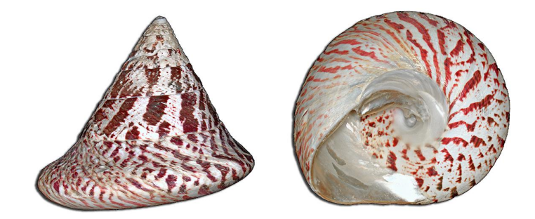
Figure 1. Tectus niloticus (Linnaeus, 1767).

Tectus niloticus (Linnaeus, 1767) (Figure 1), also known as trochus, is a marine gastropod grazer from the Tegulidae family [46] introduced in French Polynesia in 1957 for its commercial exploitation (food, craft, cosmetic) [47,48]. T. niloticus is now a protected species and is subject to regulated fishing campaigns organized by local authorities for trade and personal consumption [49]. Although anecdotal or unofficial trochus poisonings are mentioned by local populations in the South Pacific [50], no CSP cluster directly associated to the consumption of this gastropod has been formally reported so far in French Polynesia, and to date, no clinical descriptions are available.