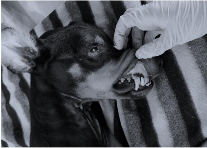
Fig. 2: Pale oral mucous membranes

There was an enlargement of popliteal, pre-scapular, and submandibular lymph nodes. On neurological examination, pain sensation (deep pain) reflexes were absent in rear limbs. Abdominal palpation revealed splenomegaly and urinary incontinence. After clinical examination of the patient, blood was collected for complete blood count (CBC), liver function test (LFT), kidney function test (KFT), and thyroid profile testing (by Radio Immune As-