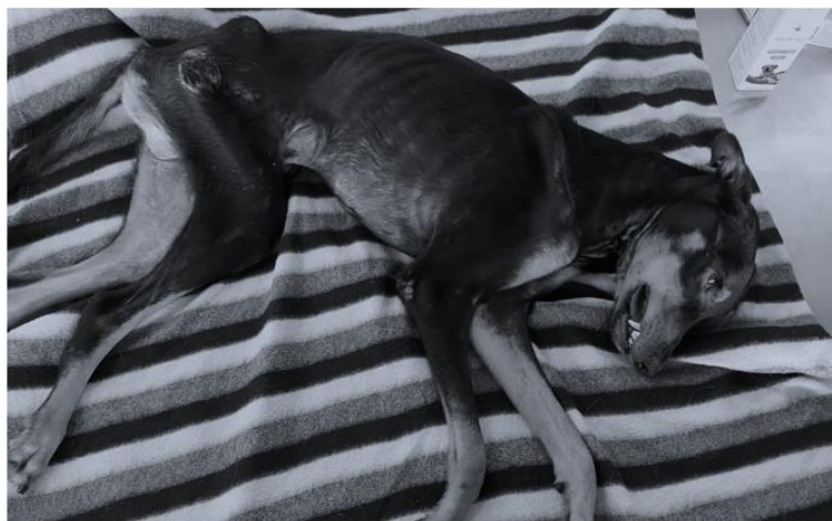
Fig. 3: Cachexia and bed sores

say-RIA). Additionally, thin blood smears were also made from ear tips and stained with Giemsa stain to detect peripheral parasitemia. The results of the laboratory investigations are presented in Table 1. The microscopic examination of the blood smear revealed the presence of T. evansi (slender forms of trypanosomes with subterminal kinetoplasts, large undulating membrane, central nucleus and a long free flagellum) (Fig. 4).