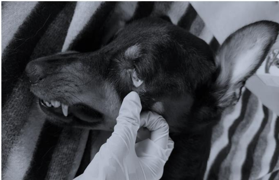
Fig. 1: Pale conjunctival mucous membranes

Institutional Biosafety committee (IBSC) approved the study based on the Declaration of Helsinki. The owner presented this dog with the complaint of non-ambulatory paraparesis. Anamnesis of the patient revealed inappetence, progressive weakness, and ataxia of the hind limbs for a fortnight. Inspection of the patient revealed evidence of cachexia, anaemia (Fig. 1 and 2), decubital ulcers/pressure ulcers (bed sores) (Fig. 3), and mild mucopurulent ocular and nasal discharge. Clinical examination of the patient revealed pyrexia ( 103^{\circ}\text{F} ), polypnoea (29 breaths/minute), and tachycardia (102 bpm).