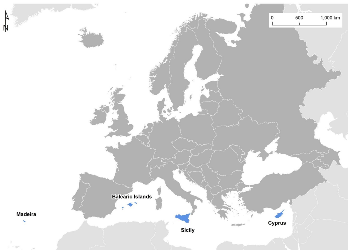
Figure 2. Location of the marinas analysed.

corresponding Scope, these units (kWh, litres, etc.) must be converted into tonnes of equivalent CO 2 , using the corresponding emission factors available through official sources.