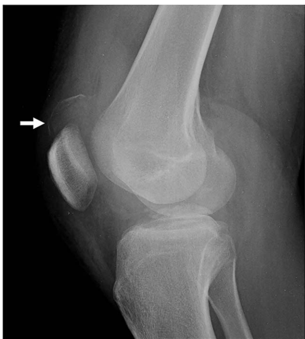
Figure 1. A 19-year-old female with sleeve fracture at the superior pole of the left patella. Patella and avulsed fragment are showed in plain radiograph (arrows).