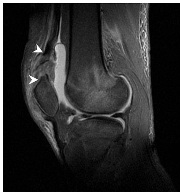
Figure 3. Quadriceps tendon rupture, cartilaginous injury (arrowheads), and joint effusion are visualized at 1.5 T magnetic resonance image (sagittal view, FSE sequence, TR 3,700ms, TE 46ms).

patella was finally reached. Then, complete removal of the blood clot and tissue debris in the joint cavity and around the broken ends of the quadriceps tendon was performed. Joint capsule and quadriceps tendon were sutured, patella fracture piece was reset and pulled down to the front, and wire fixation was applied. After surgery a gypsum fixed knee joint in the extension position was chosen for therapy. Postoperative x-ray report showed patellar position and shape of normal, fixed well. After surgery with gypsum, fixed knee joint in the extension position and weight-bearing was permitted with a crutch. Rehabilitation plan include instructing the patient postoperative quadriceps training, cast fixed knee joint after 4 weeks of continuous passive activity (CPM), and CPM functional exercise for 2 weeks. At the 6-month follow-up, the patient reported a knee free of swelling, normal appearance,