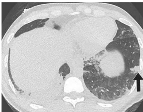
Fig. 11 Lung CT MERS CoV [31]. 27-year-old man with Middle East respiratory syndrome Patient was a smoker who was healthy otherwise. CT was performed 8 days after admission, and 20 days after onset of symptoms. Patient was eventually discharged. Lower lung CT image show large right lower lobe and small focal left lower lobe subpleural consolidations.

Chest XRays and CT Scanning (Figure 11) are recommended depending upon the presentation, and clinical course. In the Aljan study [31] the most common CT finding in hospitalized patients with MERS – CoV infection reveals predominantly