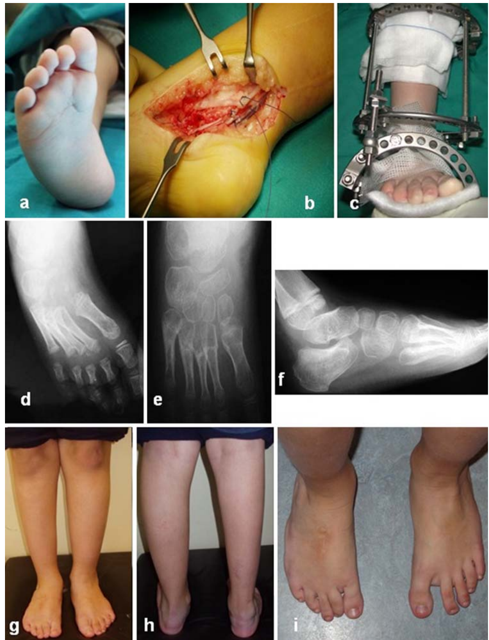
Fig. 3 Relapsed stiff clubfoot deformity (a) required soft tissue releases (b) combined with application of an Ilizarov frame (c) at the age of 3 years. Forefoot deformity recurrence (d) at the age of 6 years required proximal metatarsal osteotomies. Good alignment is maintained at the age of 10 years (e–i). Flat topped talus on the lateral radiograph (f)

subgroup was 11.4% (range 5.6–14) shorter, respectively. The respective values for the 6 unilaterally affected relapsed clubfeet treated with an Ilizarov frame were 3.2% (range 3.3–7.8%) shorter maximal foot length and 8.7% (range 5.6–10.5%) shorter maximal calf circumference.