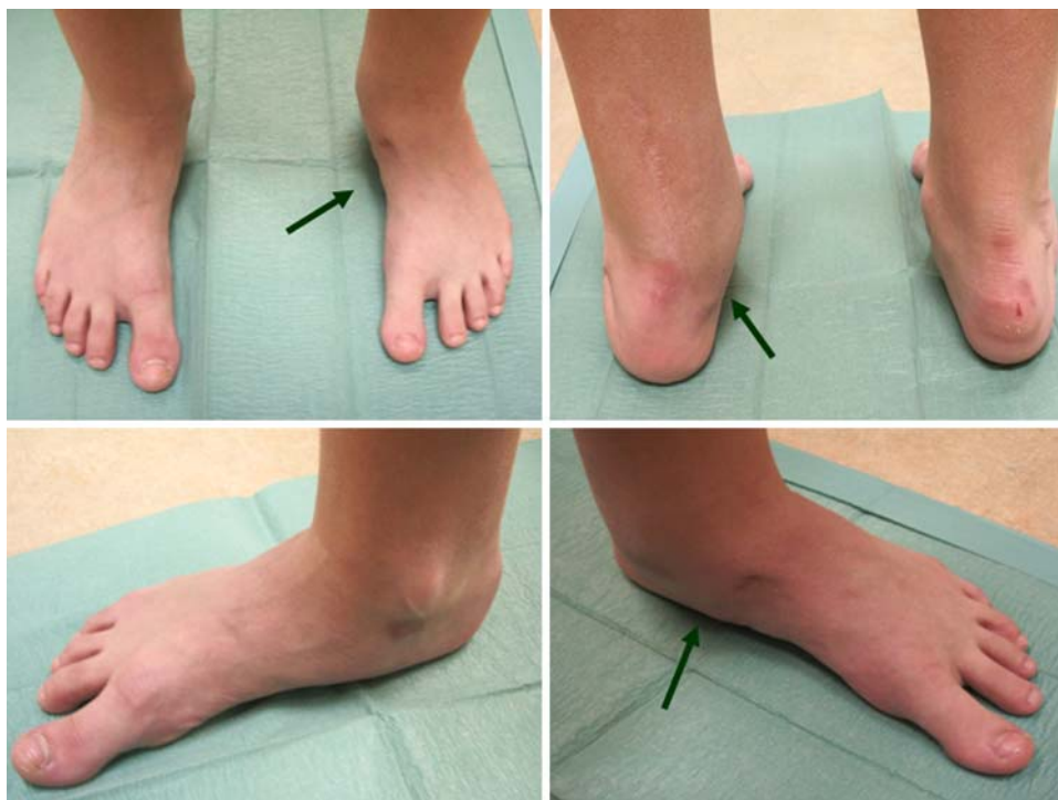
Fig. 4 Asymptomatic, well-aligned foot in a teenager after soft tissue release and Ilizarov frame application. The left foot (arrows), initially surgically treated at the age of 3, underwent surgical treatment for relapse of his clubfoot at the age of 10 years (open arthrolysis, Achilles, FHL, FDL tendon lengthening and plantar aponeurosis release accompanied by an Ilizarov frame), achieving a Laaveg–Ponseti score of 98 after 4.5 years of follow-up

well-aligned, painless foot has been maintained up to the final 48 months follow-up at the age of 9 years (Fig. 3).