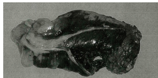
FIGURE 2: Surgical view shows an edematous rectal wall with hemorrhagic infiltration of the upper and medial rectal third. A seromuscular tear in the anterior tenia of the rectum is evident, together with an intact, bulging mucosa.

Certain histological intestines characteristics explain the peculiar manifestation of a rectal hematoma: it is the high tensile submucosa strength that protects the soft mucosa from shearing and stretching forces, while it is the loose attachment of the muscularis to the submucosa that permits formation of a cleavage plane at this junction when subjected to traumatic forces [8]. The final morphological feature is that intramural hematomas expand, causing dissection of the anterior teniae coli with subsequent rupture into the peritoneal cavity [9].