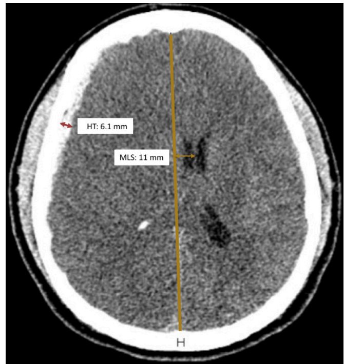
Figure 1 The thickness of the acute subdural hematoma (red arrow) was measured on a CT scan as the largest distance between the cortex and the internal table; midline, orange line; midline shift, orange arrow. HT, hematoma thickness; MLS, midline shift.

MLS was assessed in the axial plane at the level of the inter-ventricular foramen. This was measured as the longest perpendicular distance between the most displaced point of the pellucid septum and an imaginary sagittal line that associates the inner occipital protuberance and the frontal ridge. 19 25 HT was assessed as the longest distance between the inner table and the cortex. 6 Figure 1 shows an example of HT and MLS in a patient with