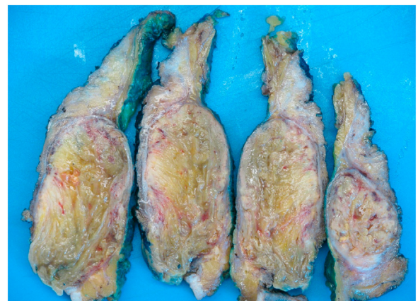
Fig. 4. Gross image of the tumour and the breast.

index showed low proliferation ratio. The biggest part of tumour was necrotized. There were no signs of malignancy. Tumour was removed radically.