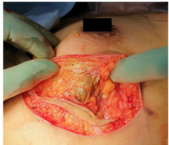
Fig. 3. Patient underwent successful nipple-skin-sparing mastectomy with immediate silicone implant reconstruction.

The patient was discussed at the Multidisciplinary team (MDT) conference. Because of the tumour size, it was decided to perform nipple-skin-sparing mastectomy with immediate silicone implant reconstruction (Fig. 3). The surgery was performed by experienced breast surgeons in a collaboration with a plastic surgeon. Final histopathological examination confirmed benign phyllodes tumour diagnosis (Figs. 4, 5). It was found to be a well-defined, encapsulated biphasic lesion with typical leaf-like pattern with low stromal cellularity. There was no atypia and no mitotic activity. Ki67