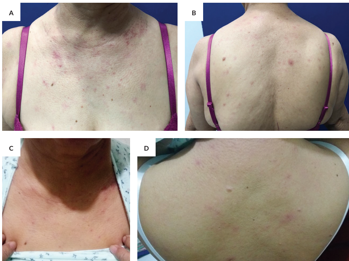
Figure 1. (A and B) Baseline photographs of a patient with multiple erythematous telangiectatic macules and patches distributed on the upper chest, upper back, and upper arms. (C and D) Significant improvement was observed after 5 sessions of NB-UVB phototherapy followed by 20 sessions of heliotherapy.

(Figure 2). Laboratory tests showed mild thrombocytopenia, elevated liver enzymes, and normal serum tryptase level. Biopsy demonstrated an atrophic epidermis and papillary dermal edema with sparse lymphocytic infiltrates and mast cells (Figure 3A). Giemsa stain was positive (Figure 3B).