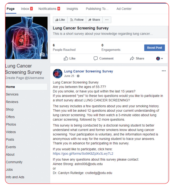
Figure 1. The Facebook advertisement that was created to recruit potential subjects.

gible then completed the LCS-12 pre-test regarding their knowledge about lung cancer screening. Participants were directed to a brief educational video about lung cancer screening that was hosted on YouTube. After viewing the video, participants again completed the LCS-12 as a post-test to again assess their knowledge about screening. The final step asked participants to rate their motivation to discuss lung cancer screening with their health-care provider.