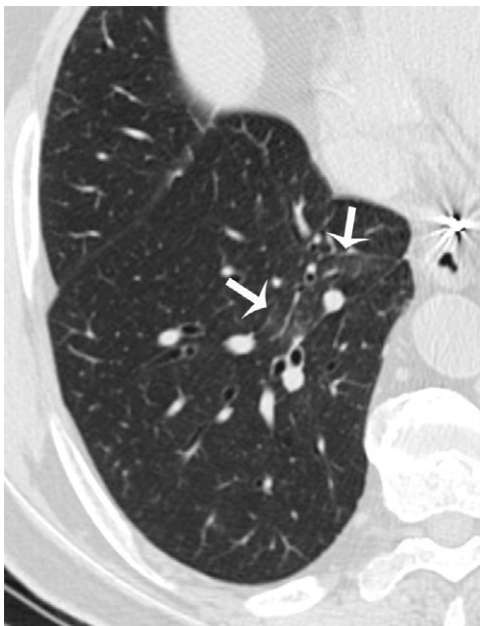
Figure 2. Unenhanced Chest CT Scan of a 76-Year-Old Asymptomatic Man with COVID-19. Note: Coned down view of the right lower lobe (lung windows) demonstrates minimal ground glass opacities (arrows), perhaps the result of the documented recent viral infection. Abbreviations: COVID-19, coronavirus disease 2019; CT, computerized tomography.

discharged (Figure 1). A CT scan performed prior to discharge showed right lower lobe ground glass opacities (Figure 2).