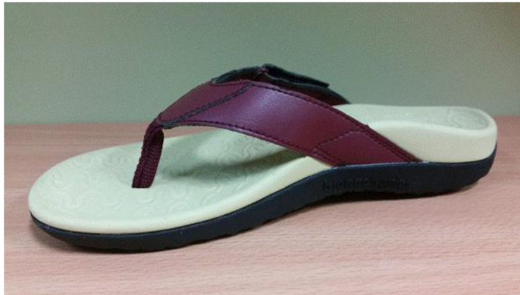
Fig. 1 Test Footwear: Foot Bio-Tec ® Orthotic footwear