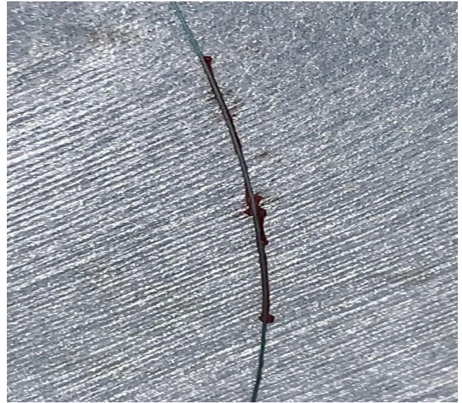
Figure 3 Clot on the tether after leadless pacemaker system extraction.

Few reports have demonstrated the difficulties encountered during leadless pacemaker implantation when pulling the tether. 6,7 Cipolletta et al 6 reported a clot on a tether. They implanted a leadless pacemaker in a 77-year-old man and experienced difficulty releasing the device and retracting the delivery due to a clot on the tether. Morani et al 7 reported a similar case; they discussed delivery system flushing and the design of the inner flushing tube system. Both reports did not mention coagulability. We, however, evaluated for coagulability and other clotting risk factors. Our patient was transfused preoperatively; RBC transfusion is a mediator of erythrocyte sedimentation and blood viscosity binding fibrinogen and can promote thrombus formation and enhance its stability. 8,9 This may have been the reason for the easy formation of clots. In fact, blood samples taken after transfusion showed hypercoagulability in this patient. Furthermore, the patient had no hereditary hypercoagulability disorders.