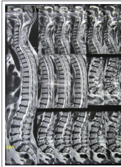
Figure 2: Magnetic resonance imaging suggestive of spondylolisthesis at S1-S2.