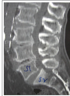
Figure 3: Computed tomography scan suggestive of spondylolisthesis at S1-S2.