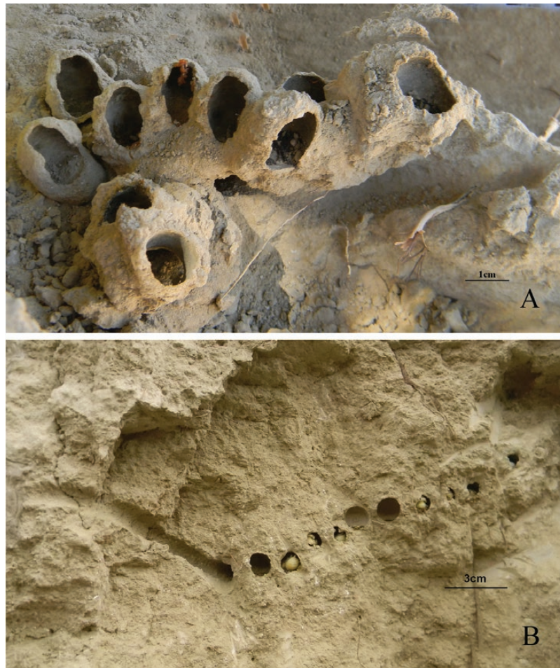
Fig. 5. Nest architecture of X. xinjiangensis . (A) The branching type. (B) The straight-chain type.