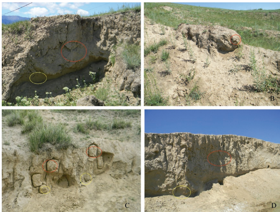
Fig. 2. Nest locations of X. xinjiangensis . (A) Gully. (B) Small mound. (C) Dike cliff. (D) Cliff. Spots circled in red in the above figure indicate breeding nest locations, while spots circled in yellow indicate wintering nest locations.

X. xinjiangensis builds two types of breeding nest: the branching type and the straight-chain type. In the branching type, cells are tightly clustered along the tunnel, while in the straight-chain type, cells are sequentially constructed parallel to one another along the tunnel (Fig. 5). Among 35 dissected nests, the branching type accounted for 62.86%, while the straight-chain type accounted for 37.14%. The different types of cell architecture vary significantly in the number of cells built in the nest (Mann–Whitney U2 independent sample test, Z = -2.695 , n = 35 , p = 0.007 ): the average number of