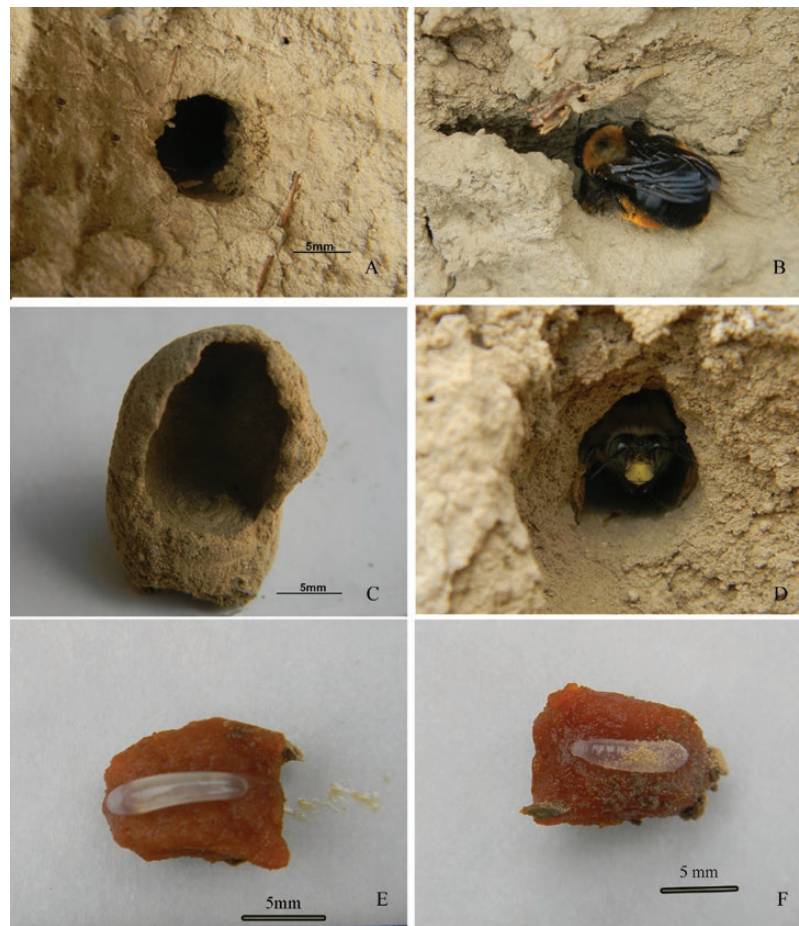
Fig. 4. The structure and composition of nests of X. xinjiangensis . (A) Nest entrance. (B) Female going home. (C) Cell. (D) Male at entrance. (E) Bee bread with egg laid on it. (F) Bee bread with larva feeding on it.

study investigated the nesting biology of X. xinjiangensis , a species of Proxycopa . The results of this study reveal that females average 16–18 cm in body length, and males average 15–17 cm in body length, which is basically consistent with the measurement reported by Wu (2000). Species in the subgenus Proxycopa are generally smaller than species in the other subgenera (13–30 mm; Michener 2007) in the Xylocopa genus. X. xinjiangensis selects nest locations in gullies, mounds, dike cliffs, or high cliff walls where the soil layer is rather thick. The number of cells per nest constructed by X. xinjiangensis ranges from 5 to 14, with a mean of 8.65. X. xinjiangensis bears certain similarities to X. olivieri , another species of Proxycopa described by Gottlieb et al. (2005), in nesting location, nest architecture, and cell structure. However, the number of cells per nest constructed by X. olivieri ranges from 3 to 6 (Gottlieb et al. 2005).