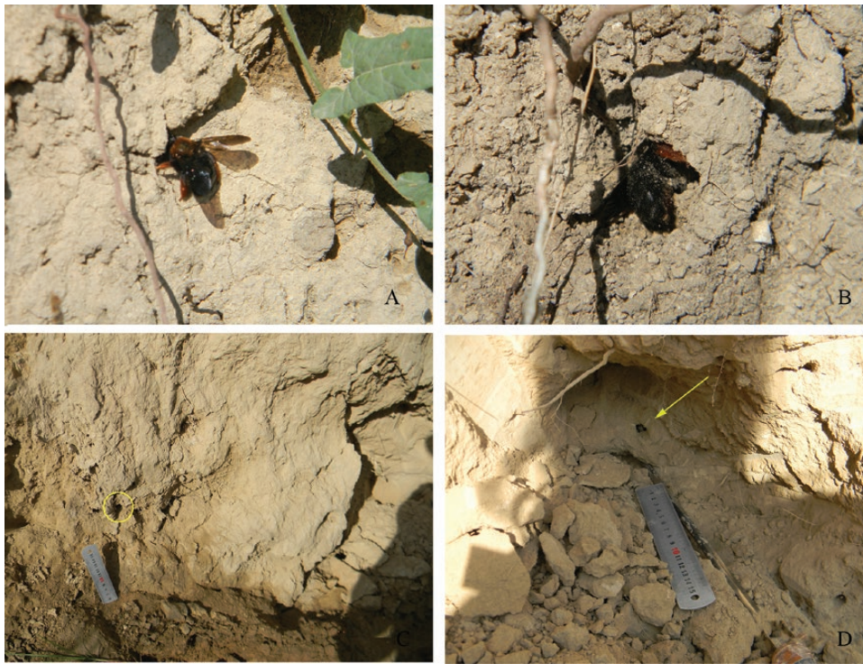
Fig. 3. Wintering nest of X. xinjiangensis . (A) Female bee looking for a nesting location. (B) Female bee excavating wintering nest. (C) Entrance of wintering nest. (D) Depth of wintering nest.

cells in the branching type was 7.53 \pm 2.06 ( n = 22 ), and the average number of cells in the straight-chain type was 9.77 \pm 2.01 ( n = 13 ) (Table 1).