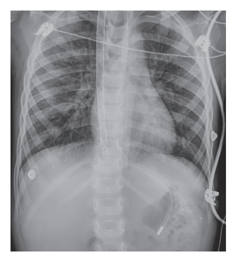
Fig. 4: Chest X-ray after WLL with marked radiological improvement