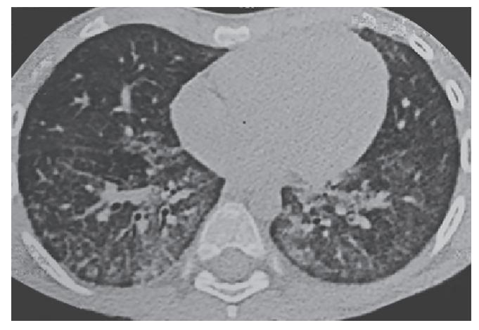
Fig. 5: CT scan of the chest after WLL with significant radiological improvement

the disorders of surfactant production or metabolism caused by a variety of genetic defects, including deficiencies in surfactant proteins B and C (SP-B and SP-C, which are encoded by the SFTPB and SFTPC genes, respectively), and variants of ATP-binding