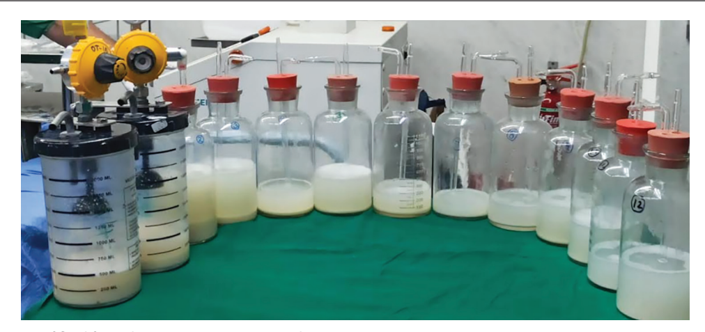
Fig. 3: Gradual clearing of fluid from the proteinaceous material