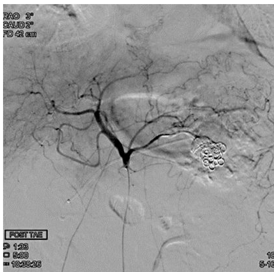
Fig. 3. Extravasation of the contrast medium was completely arrested after arterial embolization.