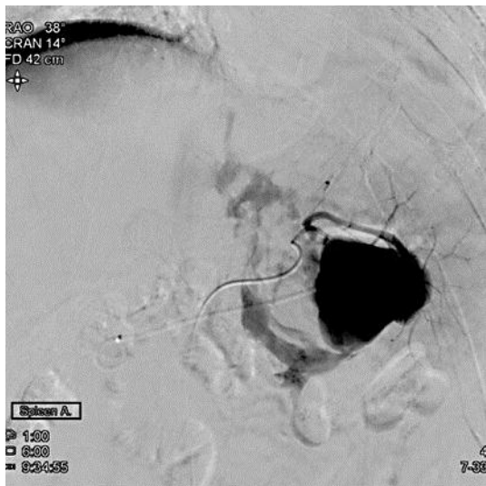
Fig. 2. A large vascular malformation with brisk contrast extravasation during angiography.