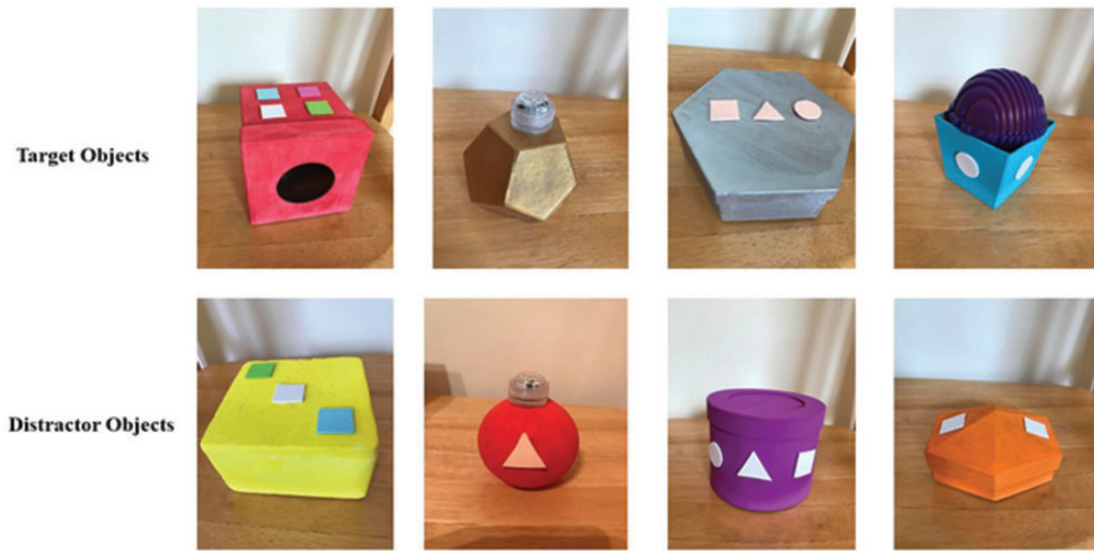
Figure 1. The four target objects (in the original colour) and their associated distractor objects below.

the array of stimuli (pictures and objects) were presented on the tray in the exploration phase.