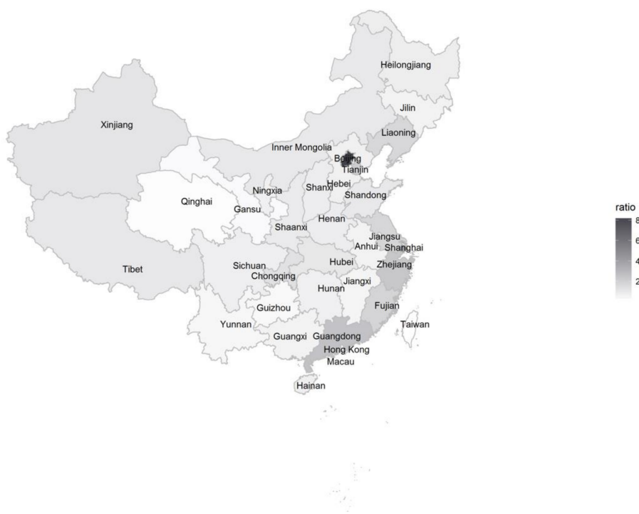
Figure 2. Geographic distribution of users with depression.