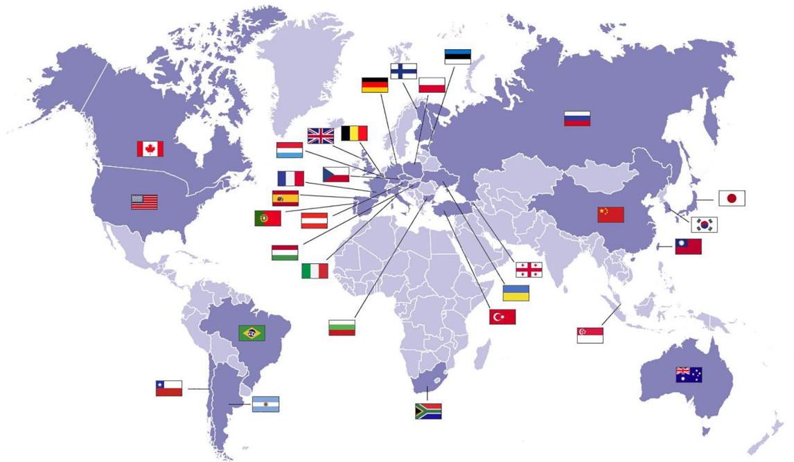
Figure 3. Countries with AMEERA-5 planned enrollment sites.

amendments, and other relevant documents have been approved by the Institutional Review Board/Independent Ethics Committee at each study site (Supplementary Materials). Written informed consent will be obtained from all patients prior to enrollment.