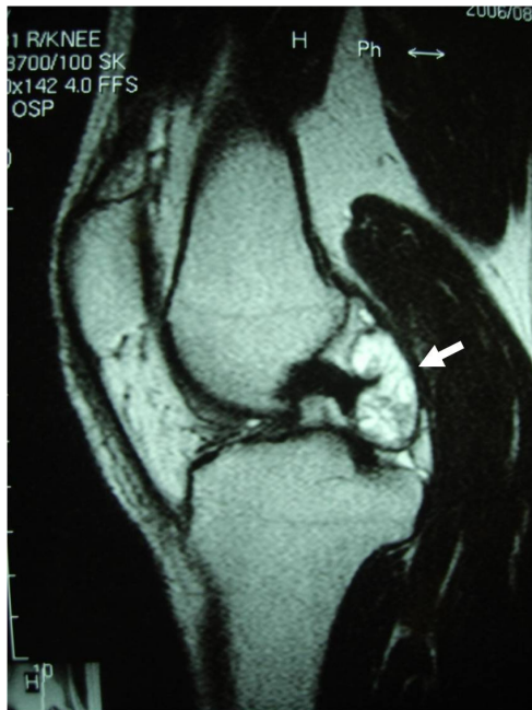
Figure 1 Preoperative MRI. Magnetic resonance imaging of the right knee showed a 2.5 cm tumor located in the dorsal area of the posterior cruciate ligament (arrow). The tumor exhibited a fluctuating high and low signal intensity with low signal septa around the tumor on T2-weighted images.