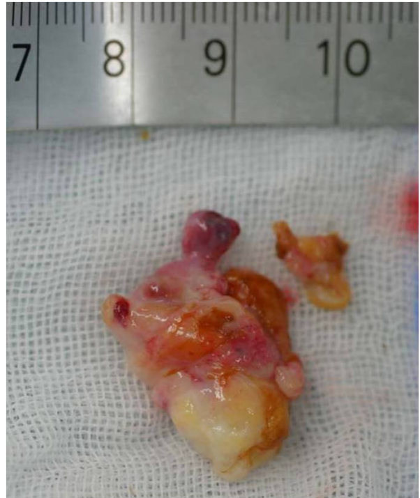
Figure 3 Gross appearance of the resected specimen. The macroscopic appearance of the resected tumor. The tumor consists of yellowish and reddish polylobular tissue.

into infiltrating and non-infiltrating types, but lesions described as being deep infiltrating angioliipomas have now been recognized by the WHO as being intramuscular hemangiomas [9].