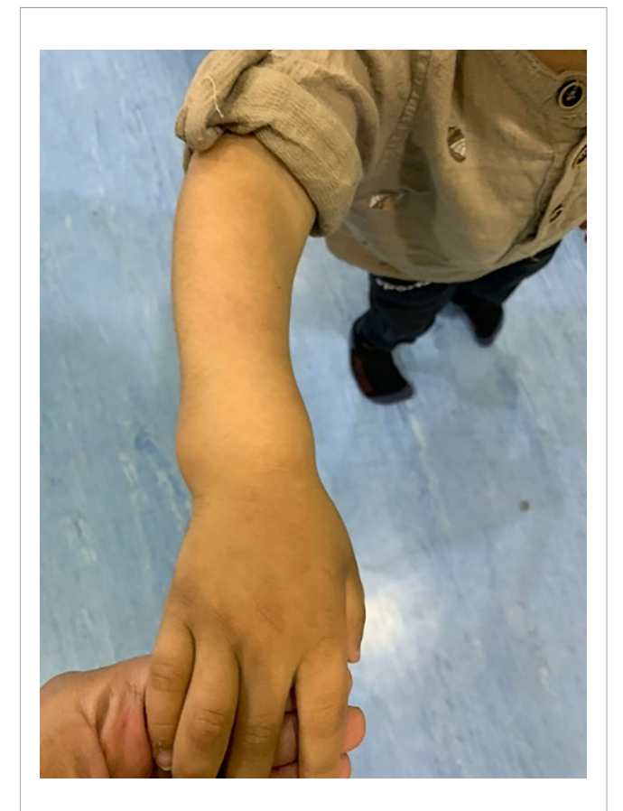
FIGURE 2 | Wrist joint widening.