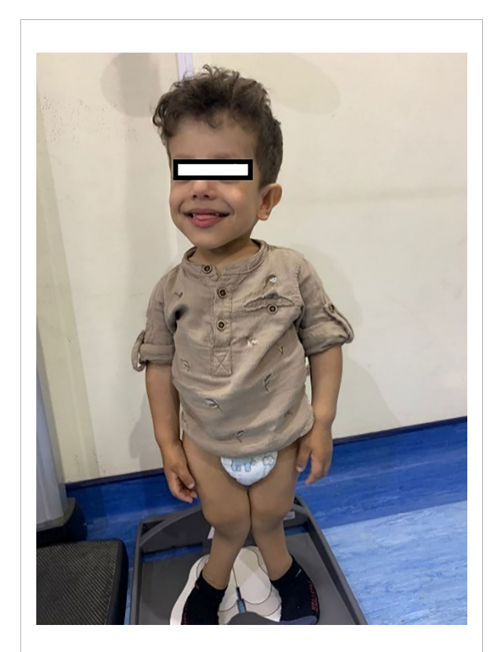
FIGURE 1 | Leg bowing and genu valgum.

His anthropometric measurements revealed a disproportionately short stature ( Figure 1 ), with a height of 77 cm, which was below the