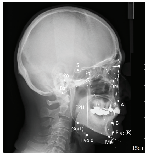
Figure 1. Cephalometric analysis. Cephalograms were obtained under the standing, occlusal, and resting expiratory conditions. A, subspinale; B, supramentale; Ba, basion; Facial axis angle of Ricketts, angle between Ba-N and Pt-(Intersection of N-Pog[R] and Go[L]-Me) line; FPH, distance of the hyoid to the Frankfurt plane (Or-Po line); Go[L], lower gonion; Me, menton; N, nasion; Or, orbitale; Po, porion; Pog[R], pogonion (Ricketts); Pt, pterygomaxillary fissure; S, sella; SNA, angle between SN and NA line; SNB, angle between SN and NB line.

Age, sex, body mass index (BMI), SNA, SNB, facial axis, FPH, sleep efficiency, the appearance rate of non-REM sleep, and REM sleep were compared between control subjects and patients with OSA. A normality test (Shapiro-Wilk test) was performed for items other than sex. Unpaired t-tests were applied if the data had a normal distribution, while Mann-Whitney's U test